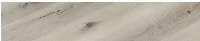
COASTAL OAK LVP44153C