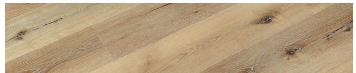
BOARDWALK OAK LVP44152C