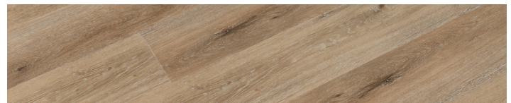
OLD TOWNE OAK LVP44162C