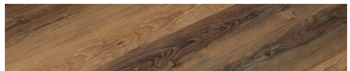
RUSTIC WALNUT LVP44149C