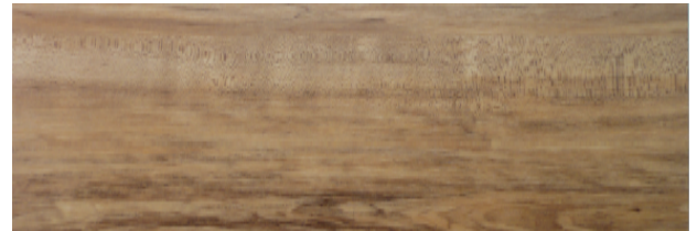
Rustic Maple LVP44617C