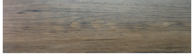
Weathered Pine LVP44619C