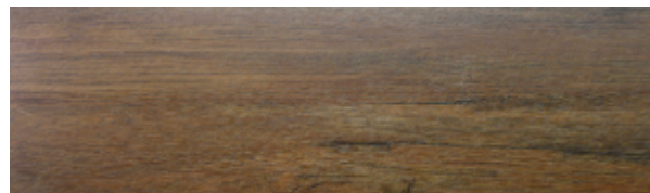
Cinnamon Oak LVP44624C