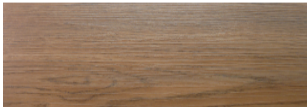
Buckskin Oak LVP44624C

Warranty Limited Twenty five (15) Year Residential Wear Warranty